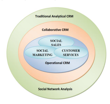
Fig. 2 Social CRM Framework[24]

Collaborative CRM using multiple channels and ways customers communicate with the company such as E-mail, fax, website, call center, and so on.